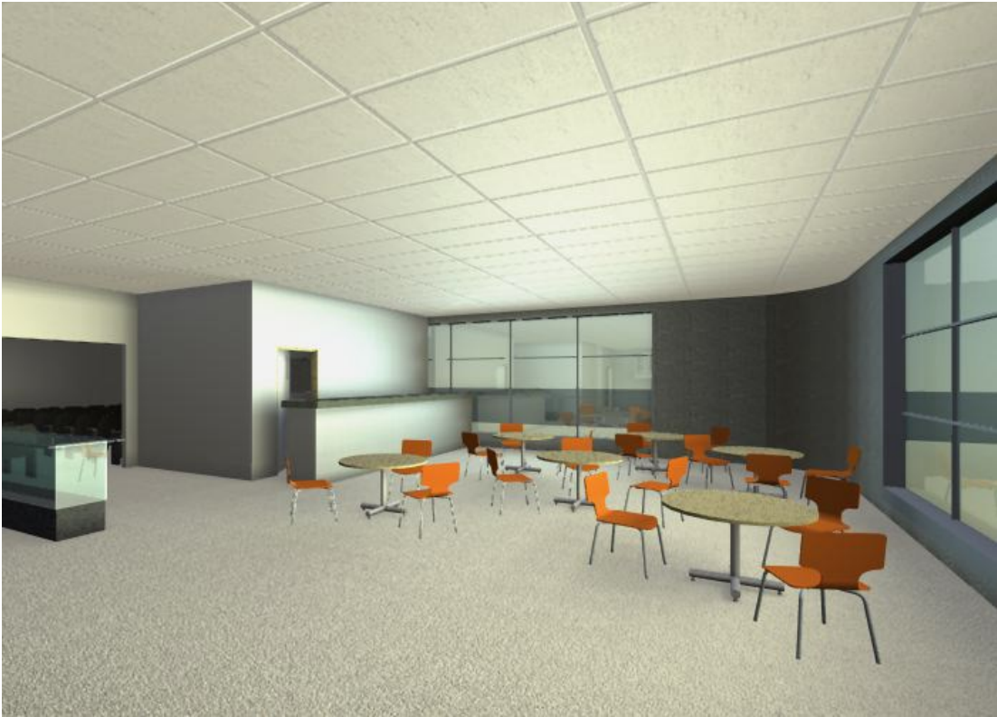
comedy club proposal - bar/ lounge: rendering with ArchiCAD