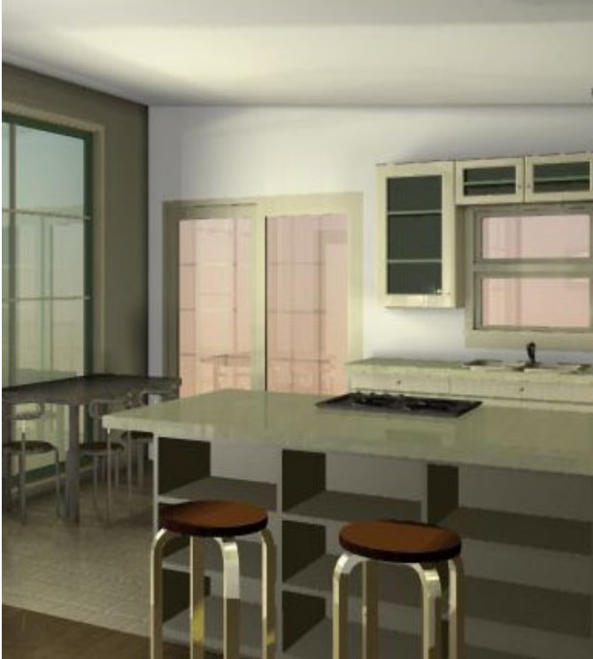
kitchen rendering with ArchiCAD